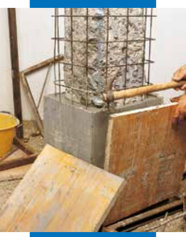
Removing wooden formwork

requirements, quality control and evaluation of conformity - General principles for the use of products and systems") and the minimum requirements claimed by EN 1504-3 ("Structural and non structural repair") for structural mortars of class R4. Mapegrout Hi-Flow is recommended for thicknesses up to 40 mm thick. For greater thicknesses, it is recommended to add suitable graded aggregates from 30 to 50% by weight of the product, only after consulting our Technical Services Department. If higher flexural and impact resistance are required, Mapegrout Hi-Flow TI 20 should be used, castable, shrinkage-compensated, fibre-reinforced, high-ductility cementitious mortar with stiff steel fibres.