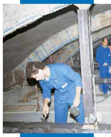
Pouring Mapegrout Hi-Flow into metal formwork