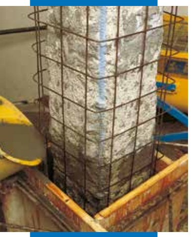
Pouring into a formwork