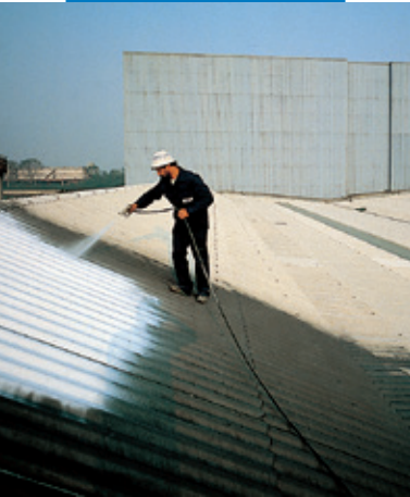
Spraying Aquaflex onto corrugated asbestos cement after treating with Malech