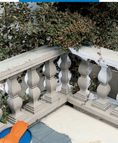
Application of Aquaflex by roller

period of time at a reasonable price. Buildings may also remain open while work is being carried out and application of the cycle, carried out by specialised contractors, is very simple. Also, with an encapsulation system, there is no toxic waste and risks to workers and the environment is reduced to a minimum.