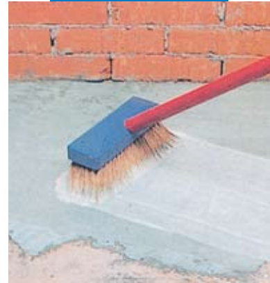
Applying cement slurry modified with Planicrete SP