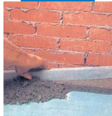
Applying cement screed modified with Planicrete SP