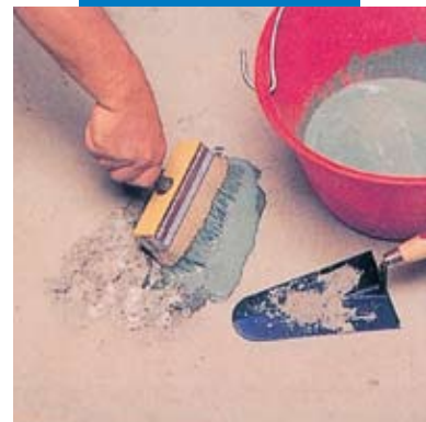
Floor patching: application of slurry